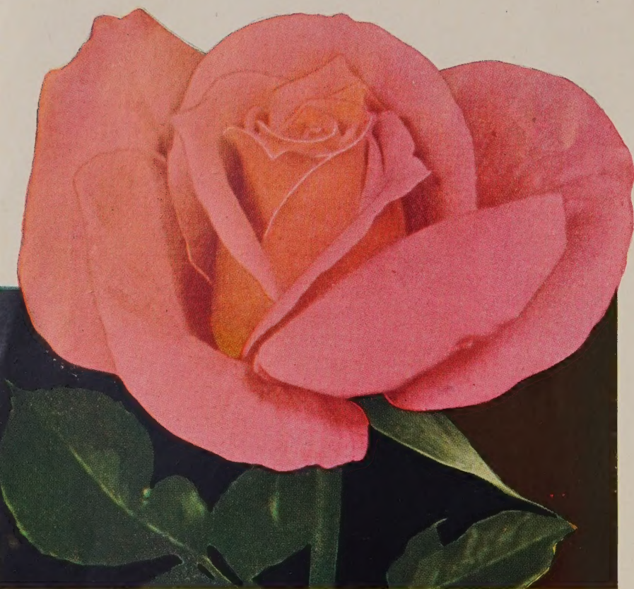
MISS CLIPPER—$1.25 each; 3 for $3.15 (Patent 522)